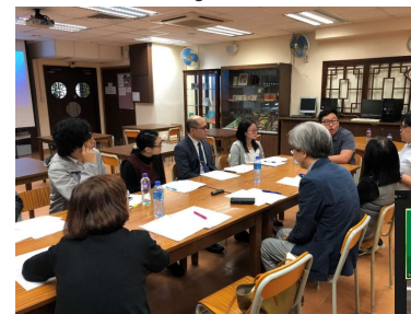
Discussion meeting after lessons 觀課後討論